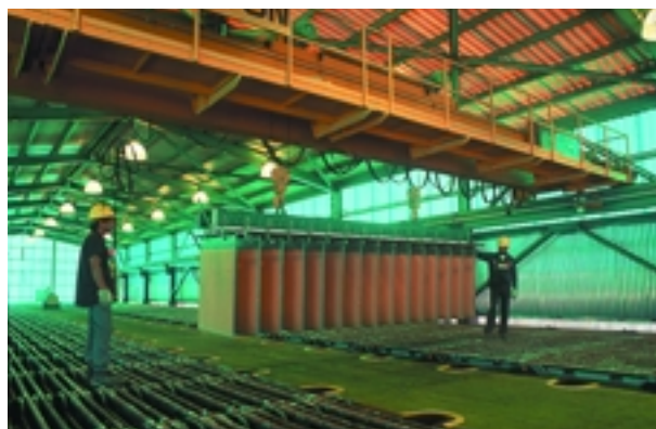
2 Electrowinning zinc metal from aqueous zinc sulfate/sulfuric acid solution is an important industrial process.

When corrosion and wear take place simultaneously, a metallic material is the best choice. Because of their hardness, the pump's metallic parts can withstand the abrasive solids. Austenitic cast steels resist both corrosion and abrasion very well. This material is successfully used in an Ahlstar wear-resistant WPP pump in a zinc leaching process (Fig. 3).