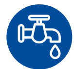
Water and wastewater